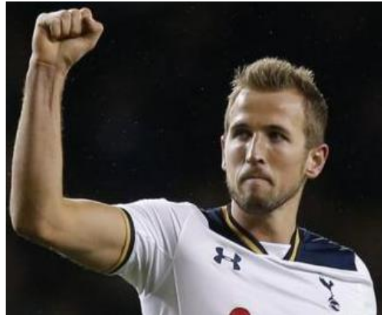
Figure 1: A very fine footballer